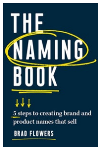
The Naming Book