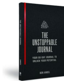
The Unstoppable Journal